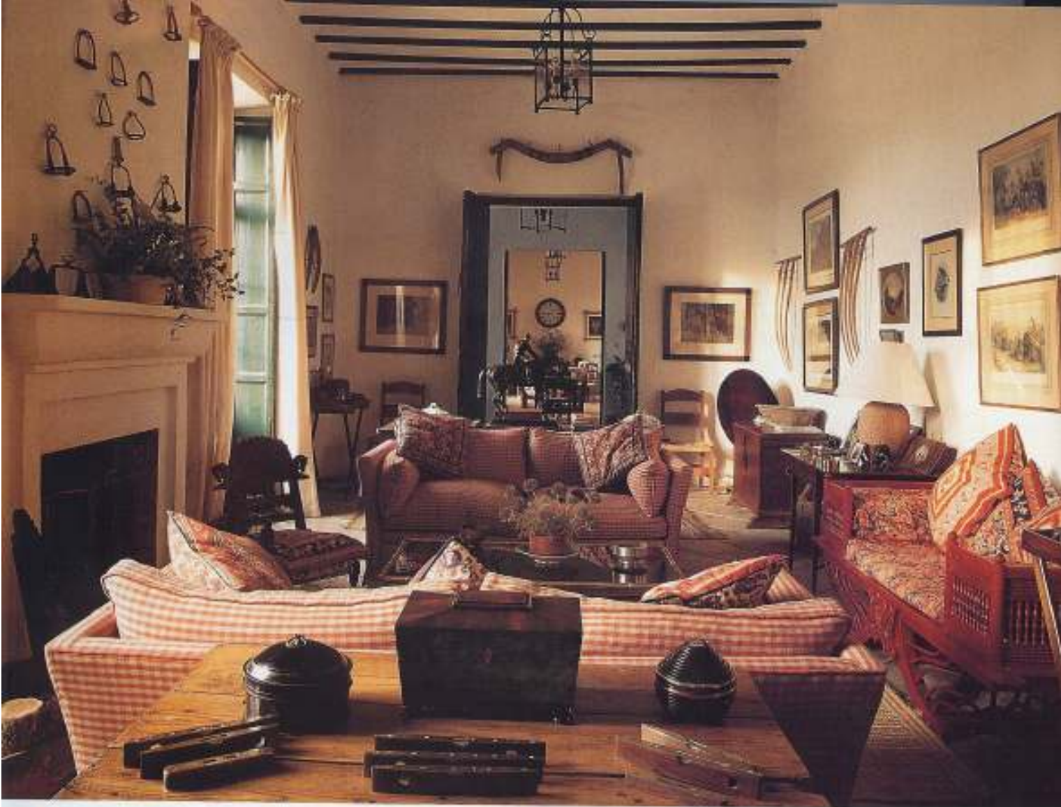
Chic checks and stripes for the Hacienda's very liveable drawing room