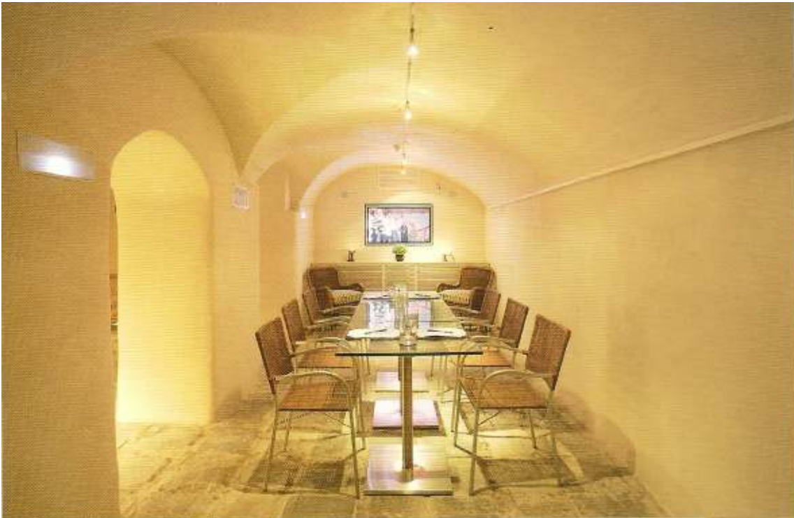
above: Meeting room mid: Junior suite